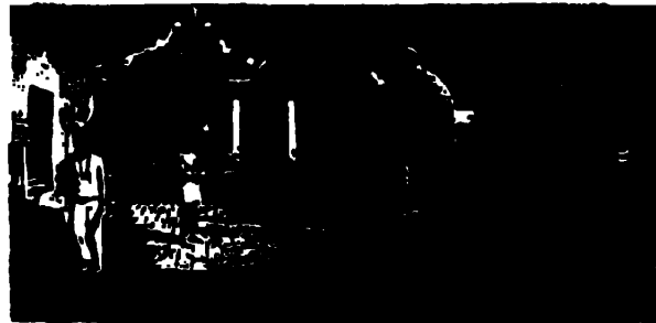
Expanded campus provides additional garden and classrooms.

CALLE PRADERA #60 ESQUINA CON CALLE SAN JERONIMO COLONIA SAN JERONIMO Tel: 13-03-65 Tara Gallegos: Tel: 13-44-20