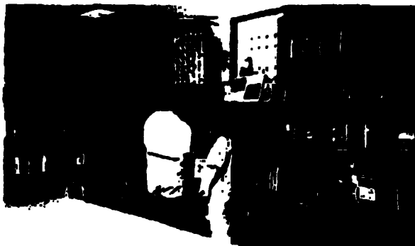
The Colby Library was partially donated by Colby College in Maine.

Foreign currency may be exchanged at the airport 24 hours a day, or at any bank between 9:00 AM and 1:00 PM Monday -Friday.