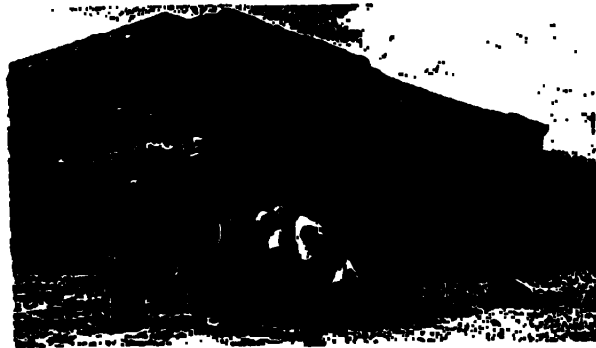
Excursions to Xochicalco Ruins and other archaeological sites are conducted by faculty members.

LEISURE FACILITIES - Golf courses, Tennis courts, bowling alleys, swimming pools at hotels and family homes, movie theaters, restaurants, bookstores, outdoor markets, performances by street musicians (marichis), and sidewalk cafes surrounding the main square (zocalo) all provide additional entertainment and leisure opportunities.