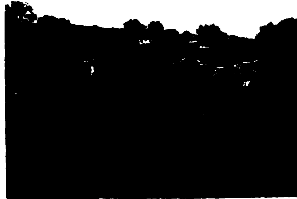
Aerial view shows portion of campus at The Center